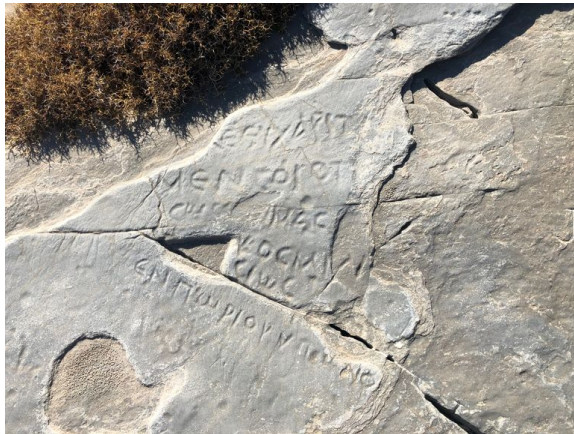
Grammata. Authors' archive.

Those who had been beaten by the sea voyage headed for the quiet refuge of the bay. Once over the headland, they entered the safety of calmer waters. People who had gone through good and bad on their voyage etched their thanks into the rocks to the Gods who had guided them to safety. They came so close to drowning, to death, but they managed to survive. They had witnessed the wrath of the seas and now celebrated the impermanence of their existence.... By carving the name of their ship in stone, pilgrims sailing the seas of ancient antiquity, Roman times and Byzantium gained divine protection from the fierce north winds of the Aegean for centuries.