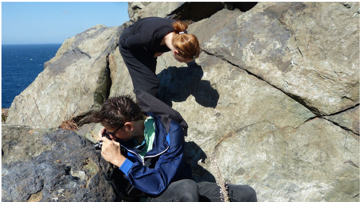
Engravings, Syros.

According to Teos, the engravings may be messages, important information for visitors to the islands, a kind of social network of the indigenous inhabitants of the Cyclades. The islands were not distant worlds. From time immemorial, they were a living network in which dynamic communication and exchange, influenced by the element of the sea, took place. The mass of water, while limiting travel, also encouraged people to explore and overcome challenges, motivating them to leave messages to themselves and their gods on the islands.