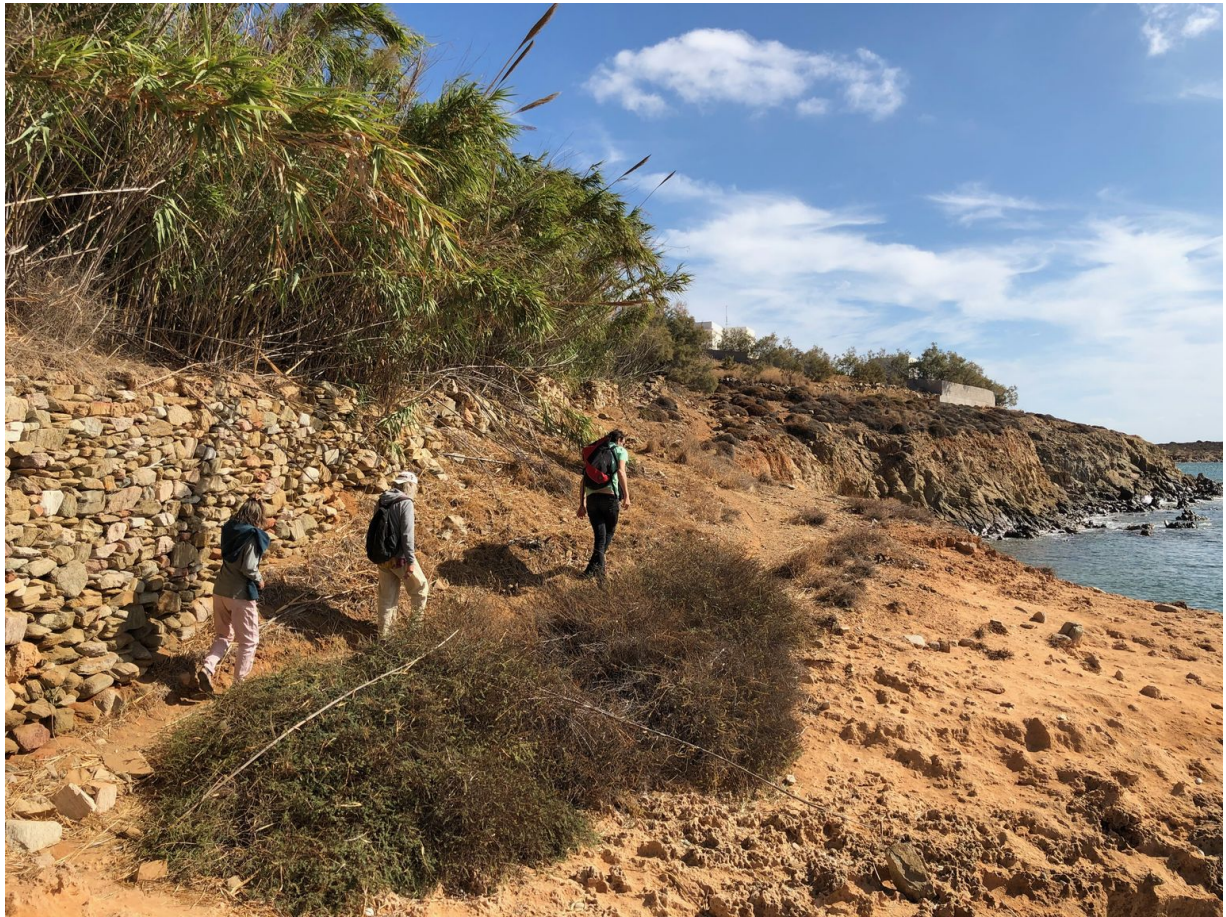
Syros.