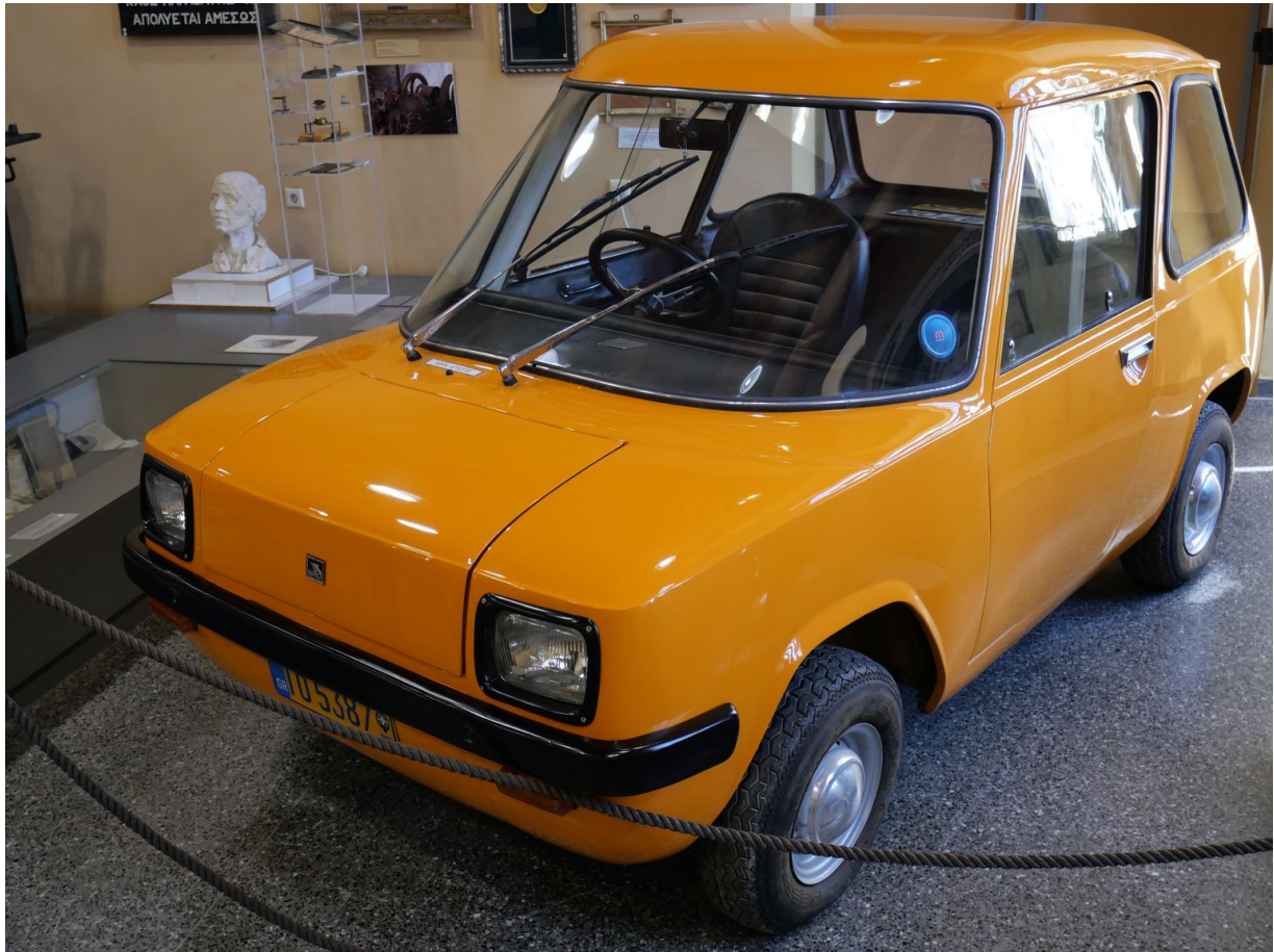
The first mass-produced electric car in Greece—and possibly in the world.

The second, slightly more tragic curiosity was a paddlewheel boat designed for sea travel. Its uniqueness lay in the fact that it was a steam paddlewheel boat, used exclusively for river navigation. Unfortunately, it was only a matter of time before it would succumb to the harsh weather conditions in the Aegean Sea. A ship called the Patris, which provided regular large-scale transport of people and goods between Syros and Athens, sank off the coast of the island of Kea in February 1868. Thanks to the efforts of people and the memories of a few divers, it was found and partially recovered. It is a flagship story of the local industrial history that the local people pride themselves on. It is interesting to see which history is being restored and which remains rather in the background. A ship emerging from oblivion has been put back into the story of the island's history and its place in modern industrial history. 2