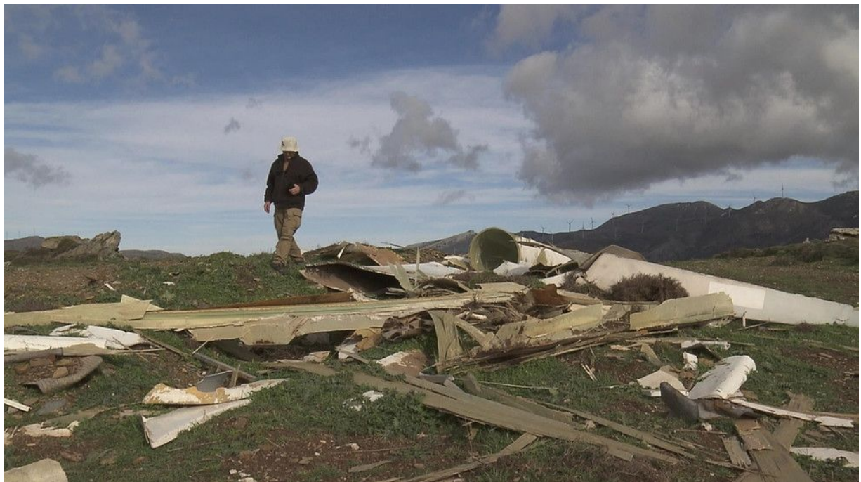
Wind farms in the Cyclades.

Already in Athens, environmental activists have drawn our attention to the fact that, under the guise of green energy production, an ecological disaster is taking place here that is destroying the islands' ecosystems. The wild expansion of wind farms is having an impact on fragile habitats, bird sanctuaries, and the overall landscape of the islands. Dilapidated power stations are rusting away in pristine nature as a memento of the reckless drive to cash in on the green energy subsidy boom. Looking at the ruins of dysfunctional wind turbines that have not been repaired or cleaned up creates a mysterious sense of existential distress: we are witnessing a kind of accelerated history that could very well be our own, although we do not recognize our own ideas about the future of this renewable resource in it.