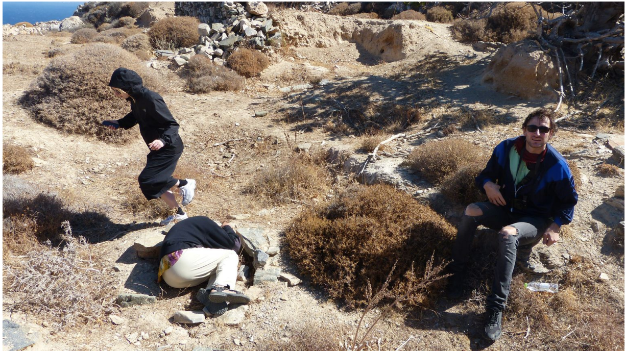
Chalandriani and Kastri. The north wind is blowing. Teos curls up in a ball by a tomb at the site of the discovery of a prehistoric settlement and burial site. The dead were placed in graves in foetal positions here.

Apano Meria thus takes on two levels in our investigation: the experiential and the political. The place confronts us with its rawness and its strange beauty, which we can touch, which we can walk in. But it is also the terrain of a political struggle with the processes of ruination that arise from the desire to commodify everything that can be commodified on the islands: the land, the wind, the sea and the culture. These two levels are intertwined. Without a relationship with the island ecosystem, there would be no effort to save it—and without the politicization of that relationship, the islanders would soon have little left.