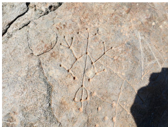
Engravings, Syros.