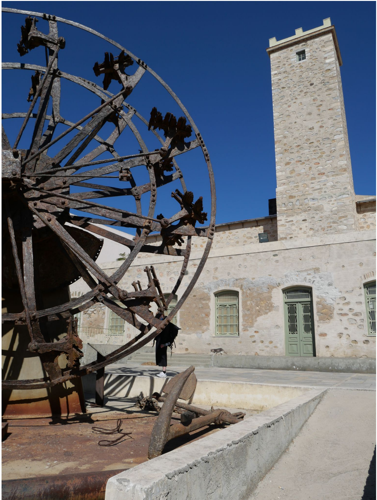
Museum of Technology and paddlewheel of the wrecked Patris.