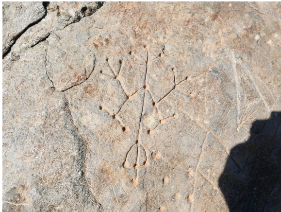
Engravings, Syros.