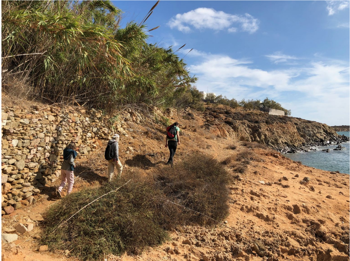
Syros.