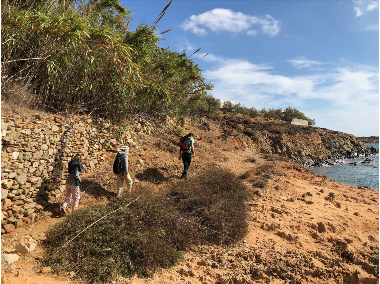
Syros.