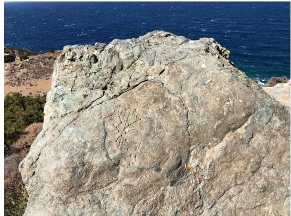
Engravings, Syros.