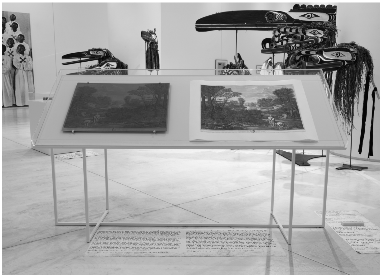
Étienne Baudet, “Paysage avec Diogène” after Nicolas Poussin, 1701. Copperplate, collection Musée du Louvre, Département des arts graphiques, Paris (left); “Paysage avec Diogène” after Nicolas Poussin, 2017. Etching, produced by Réunion des musées nationaux, collection of Pierre Bal-Blanc (right). Installation view at EMST—National Museum of Contemporary Art, Athens, documenta 14.