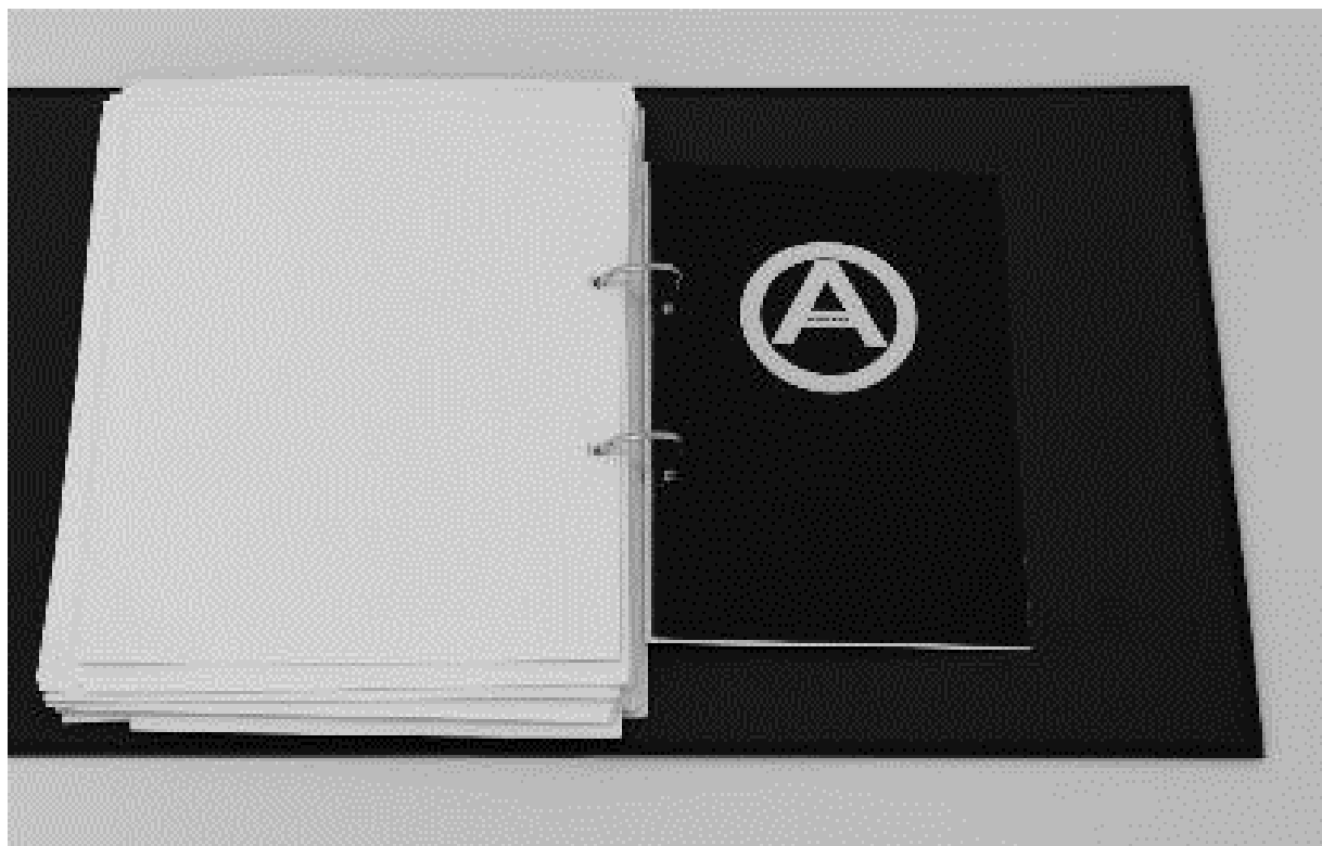
Christopher D'Arcangelo, Archival materials (1965–79). Papers, Fales Library and Special Collections. Installation view at EMST—National Museum of Contemporary Art, Athens, documenta 14, 2017.